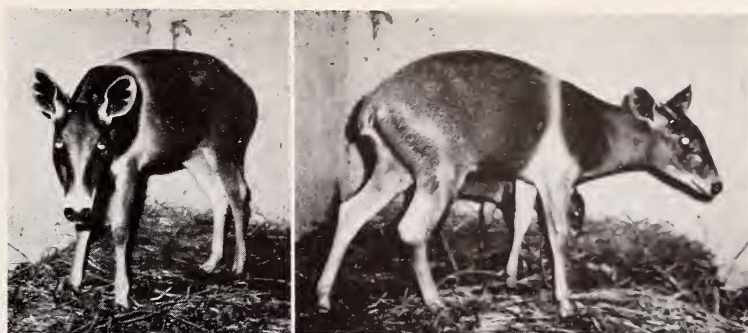
Fig. 4 (left). Juvenile male Cephalophus jentinki (Thomas, 1892) taken in the Tchien area of Grand Gedah County, Liberia (Photo: Mr. HARRY GILLMORE) — Fig. 5 (right). The same juvenile male Cephalophus jentinki (Thomas, 1892) as in illustration 5 approximately 2½ years old. The photograph shows the unusual coloration of the pelage so characteristic of this duiker (Photo: Mr. HARRY GILLMORE)